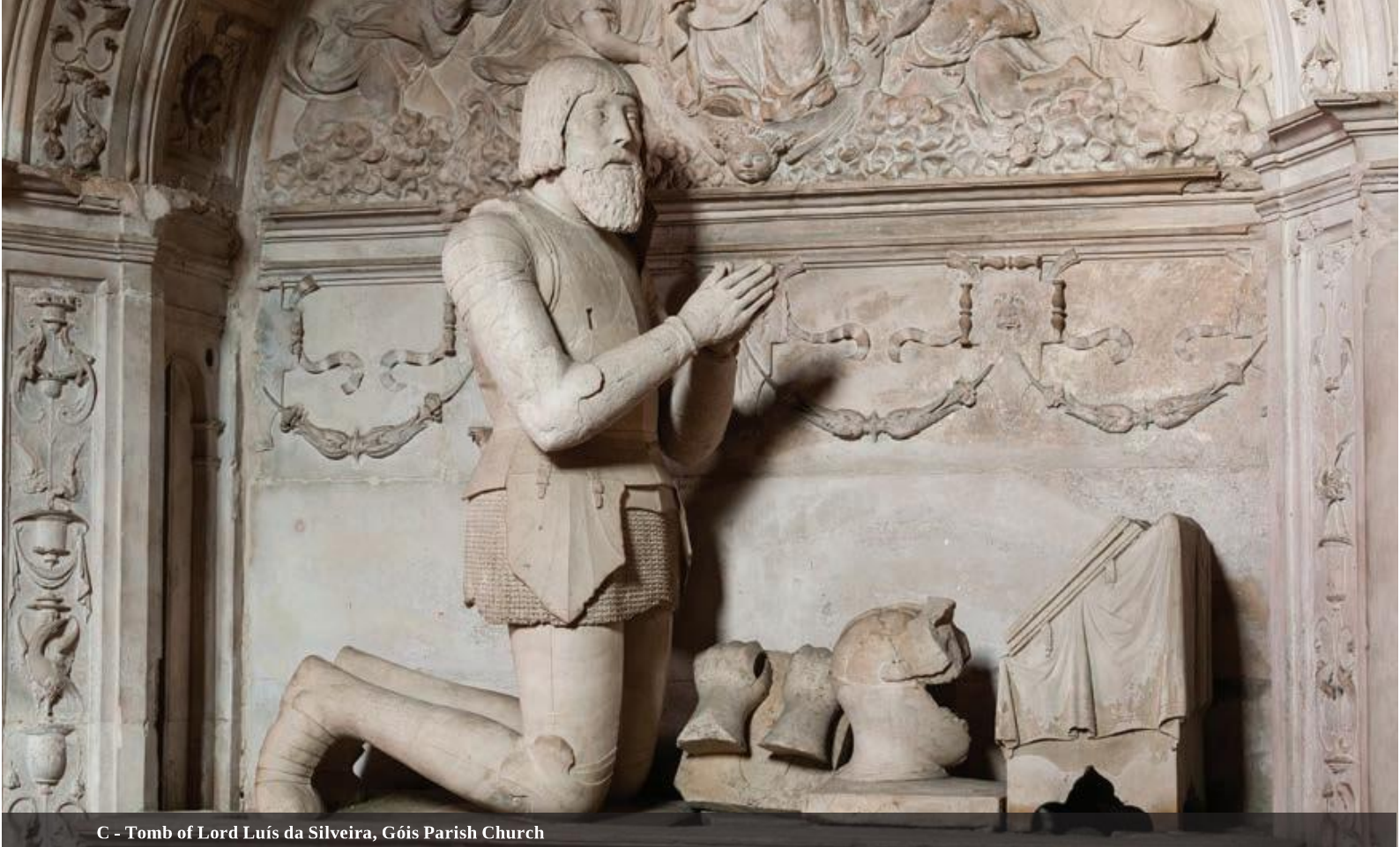
C - Tomb of Lord Luís da Silveira, Góis Parish Church